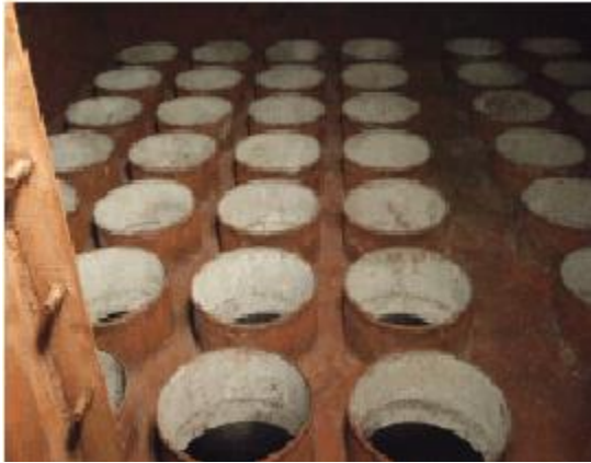
Before – upper area