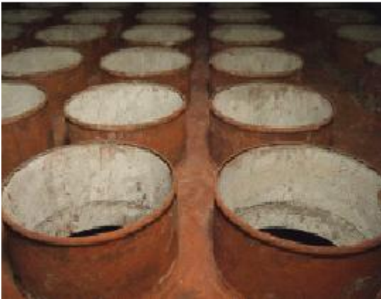
Before – upper area magnified