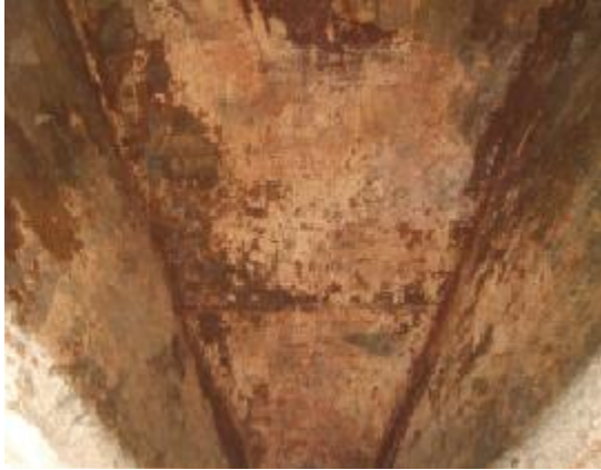
After power wash – insides