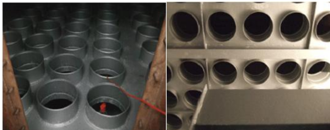
2nd RUST GRIP application