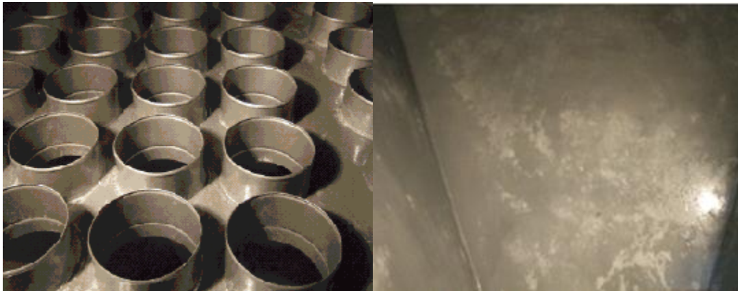
1st RUST GRIP application