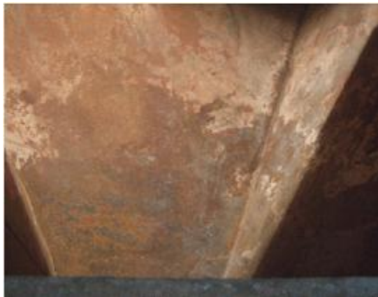
After grinding – insides