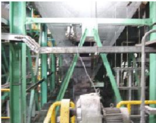
Lower area of filtration facility