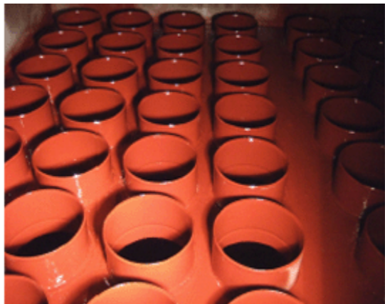
1st Lining Kote application