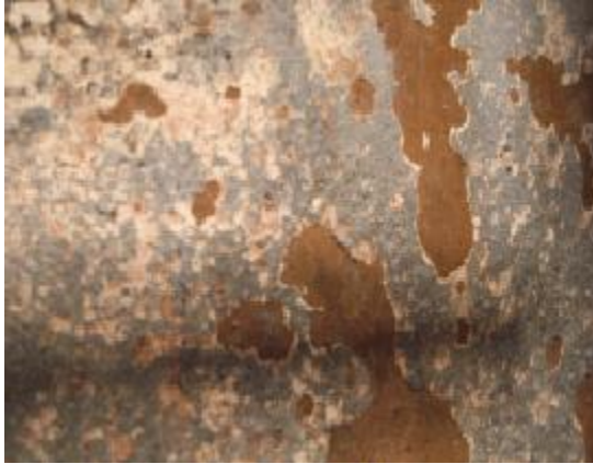
Before – lower area magnified