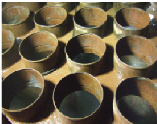
After power wash