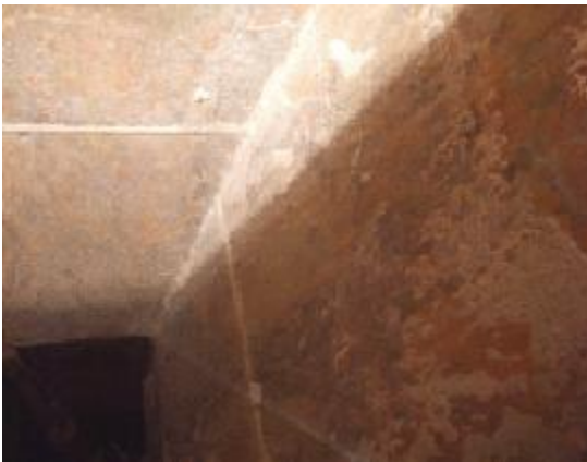
Before – lower area