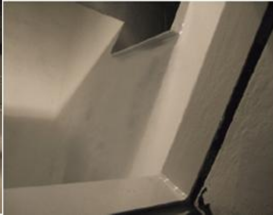
2nd RUST GRIP application