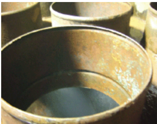
After grinding – upper side magnified