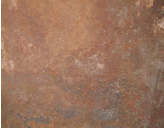
After grinding – lower side magnified