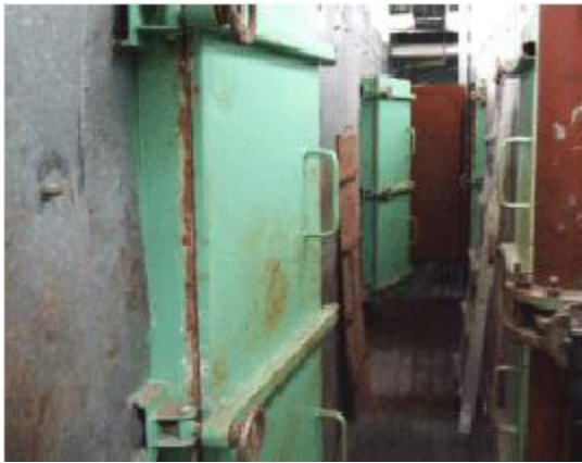
Upper area of filtration facility

METHOD: Power wash with water first and then grind Apply RUST GRIP ® twice (Ave. 200~250microns) Apply LINING – KOTE ® twice (Ave. 200~250microns)