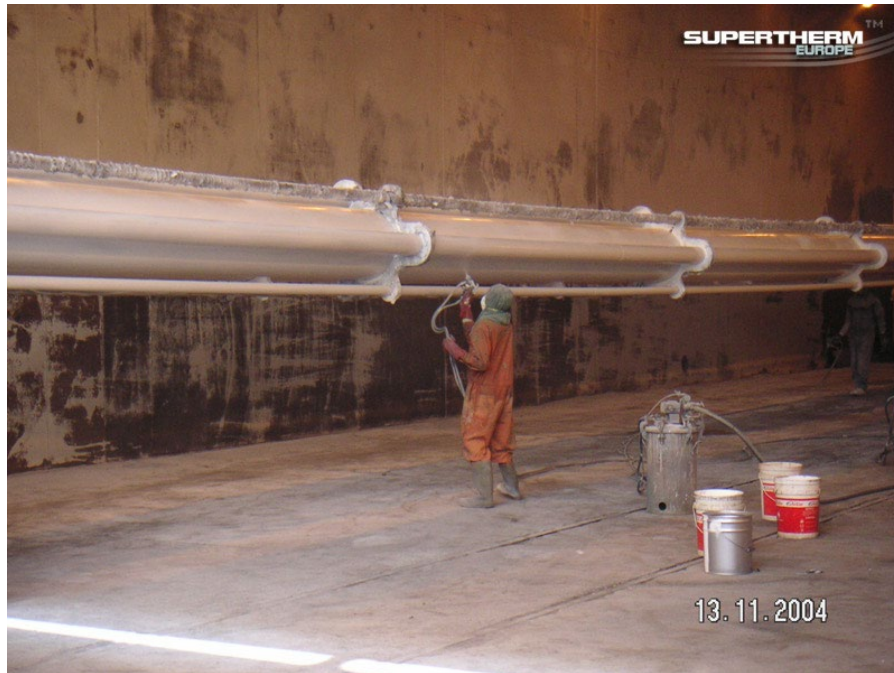
Applied top coat of ENAMO GRIP ®